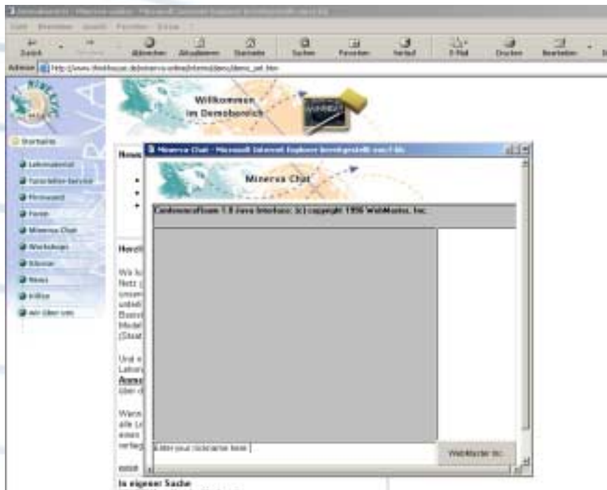
Figure 2. Screen shot from the Minerva online chat room